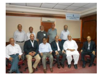
A Group Photographs