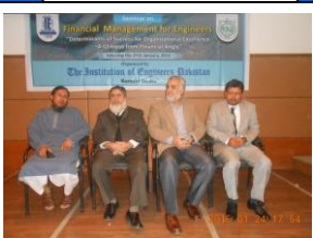
A Group of Panelist